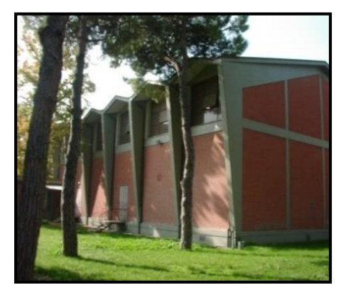
Windows: single glazed windows with iron frame