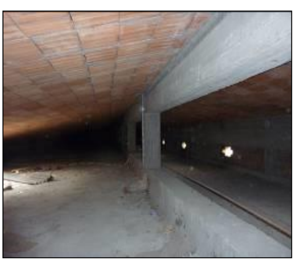
Roof and slab/ceiling (unheated attic floor) : concrete and brick masonry